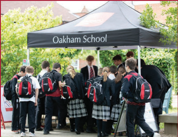
Over 125 activities, ranging from a well-established MUN through to Sailing and The Freddie Groome Enterprise Challenge