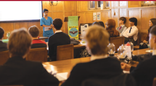
An outstanding programme of Torch Lectures